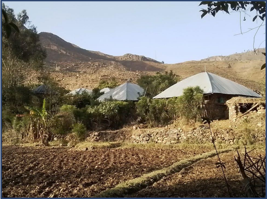
A group of rural houses in a field in Mai Liham